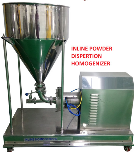
INLINE POWDER DISPERSION HOMOGENIZER