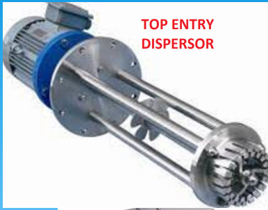
TOP ENTRY DISPERSION HOMOGENIZER