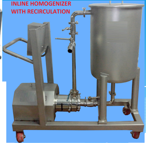
INLINE HOMOGENIZER WITH RECIRCULATION